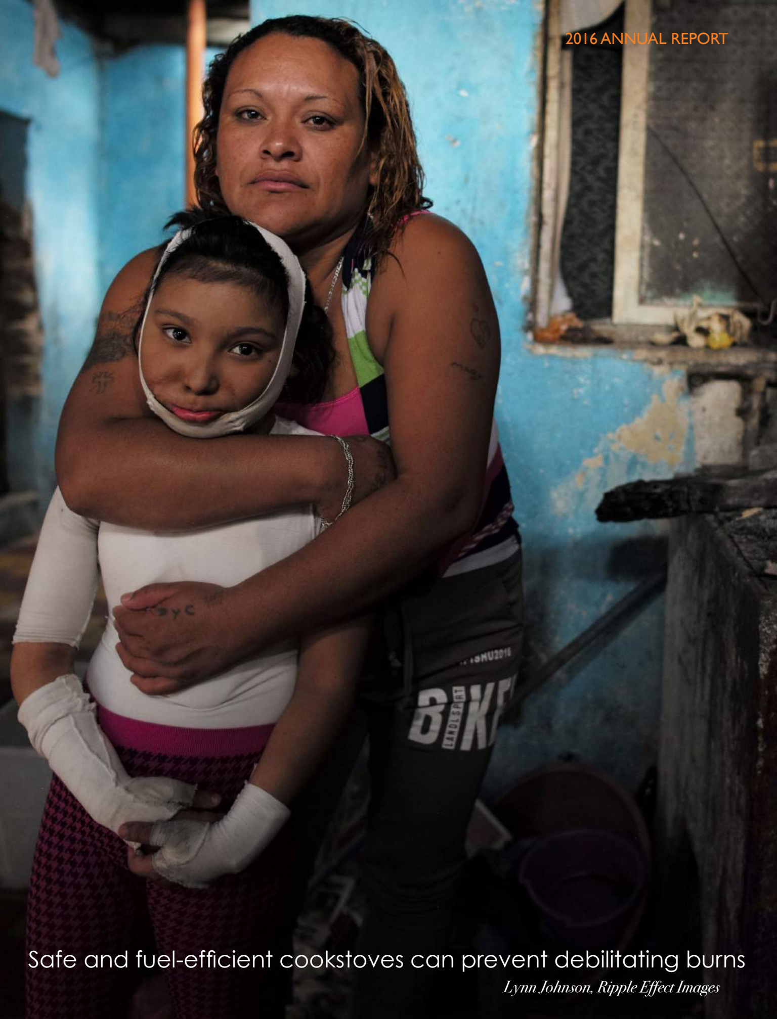
Safe and fuel-efficient cookstoves can prevent debilitating burns